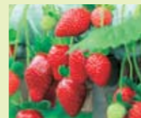
Genting Strawberry Farm