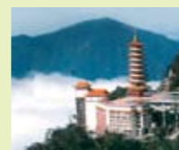
Chin Swee Temple